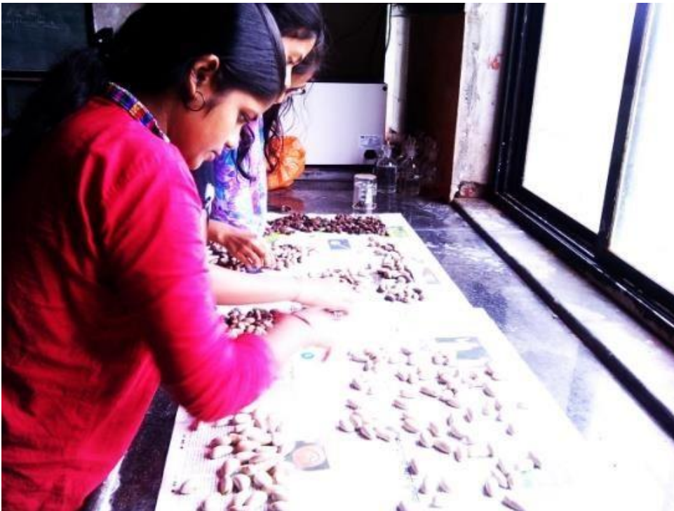
Seed Collection activity, 18 June 2015