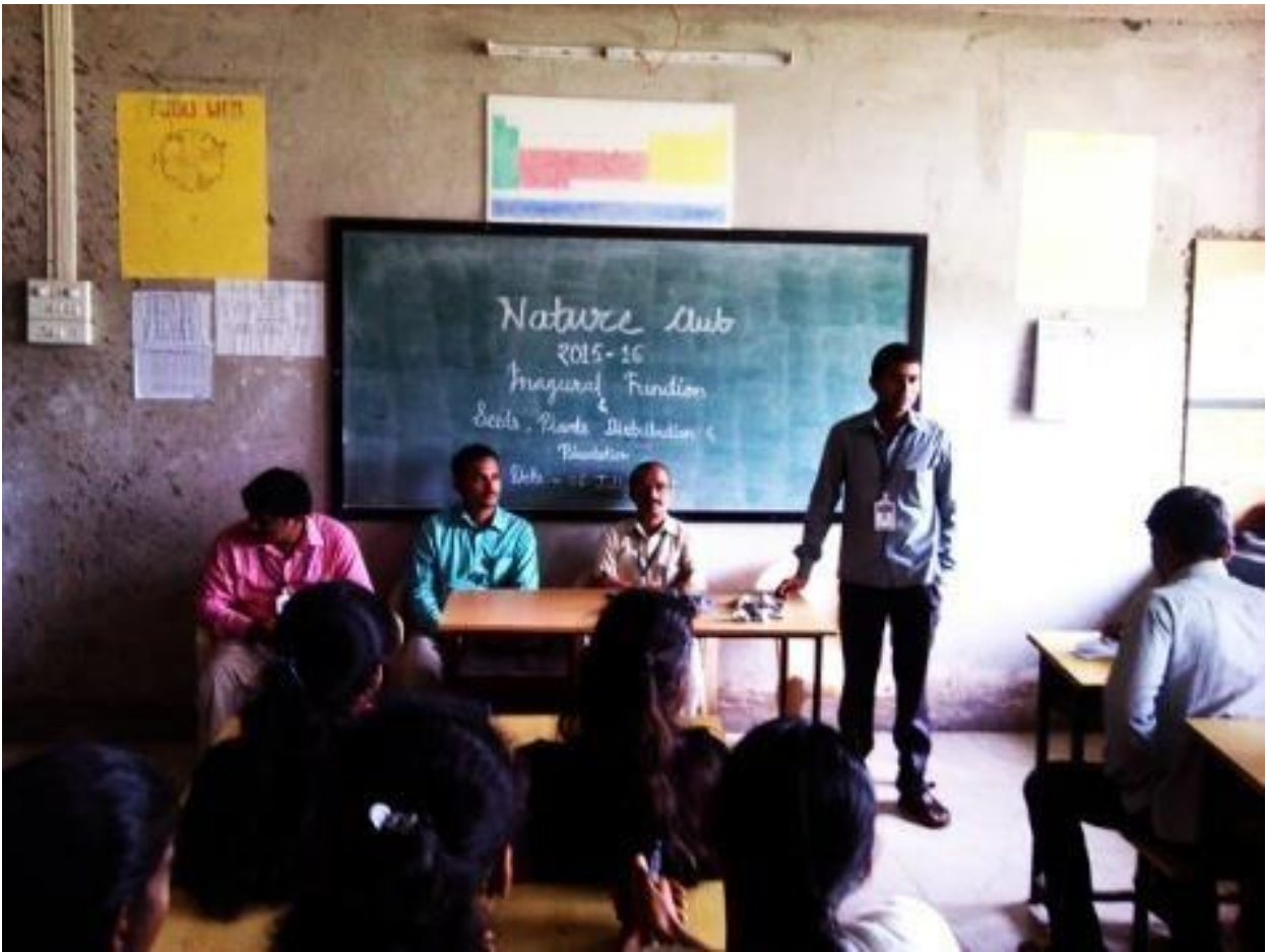
Inauguration of Nature Club and Plants Distribution, 14 July 2015