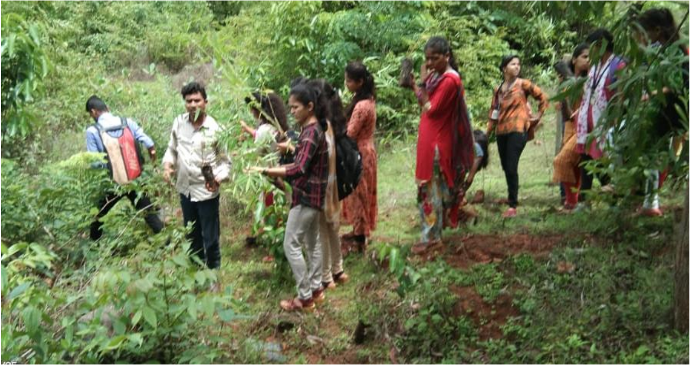
Tree plantation activity, volunteers, 2019-20