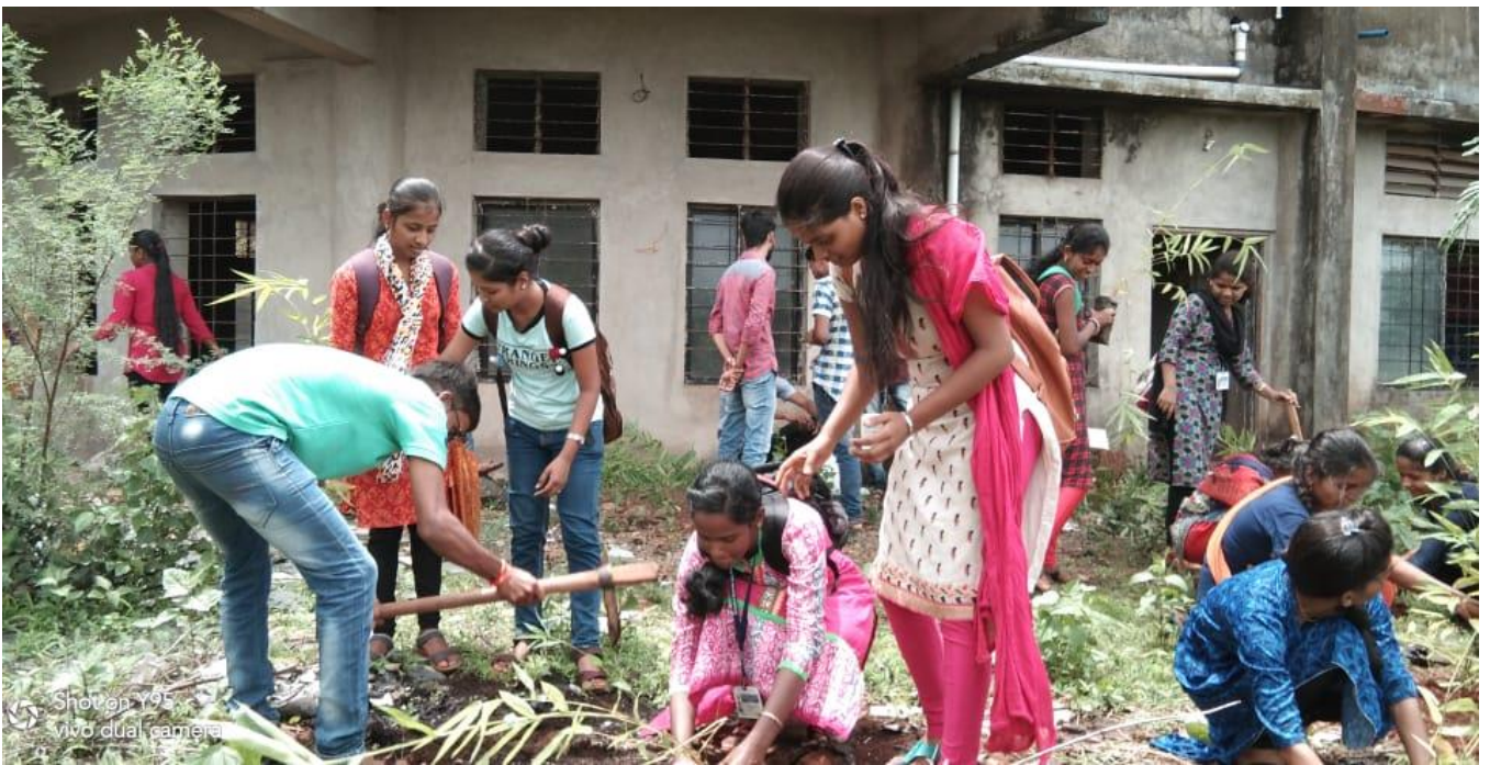
Tree plantation activity, volunteers, 2019-20