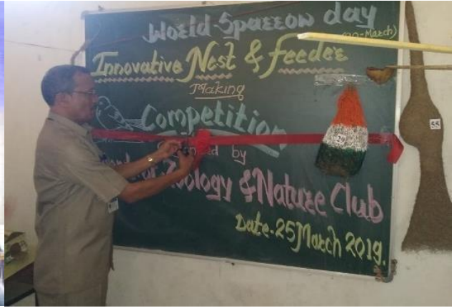
*Innovative nest and feeder making competition-