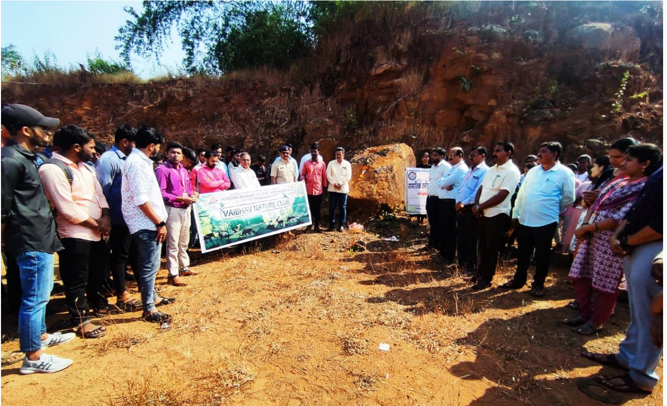
Worshipping of Mountain during International Mountain Day on 11 th Dec. 2023