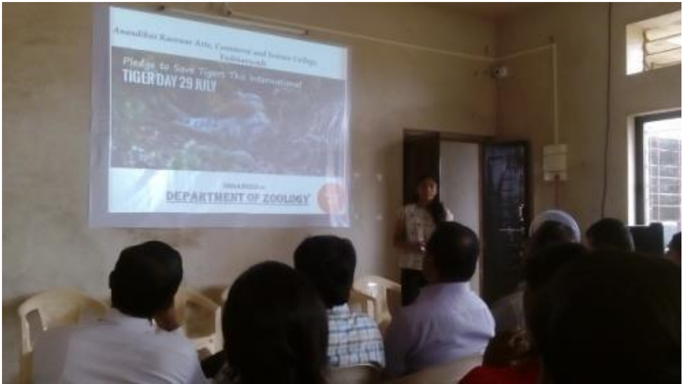
T.Y.B.Sc. Student during her speech on occasion of Tiger Day celebrated on 30 th July. 2018