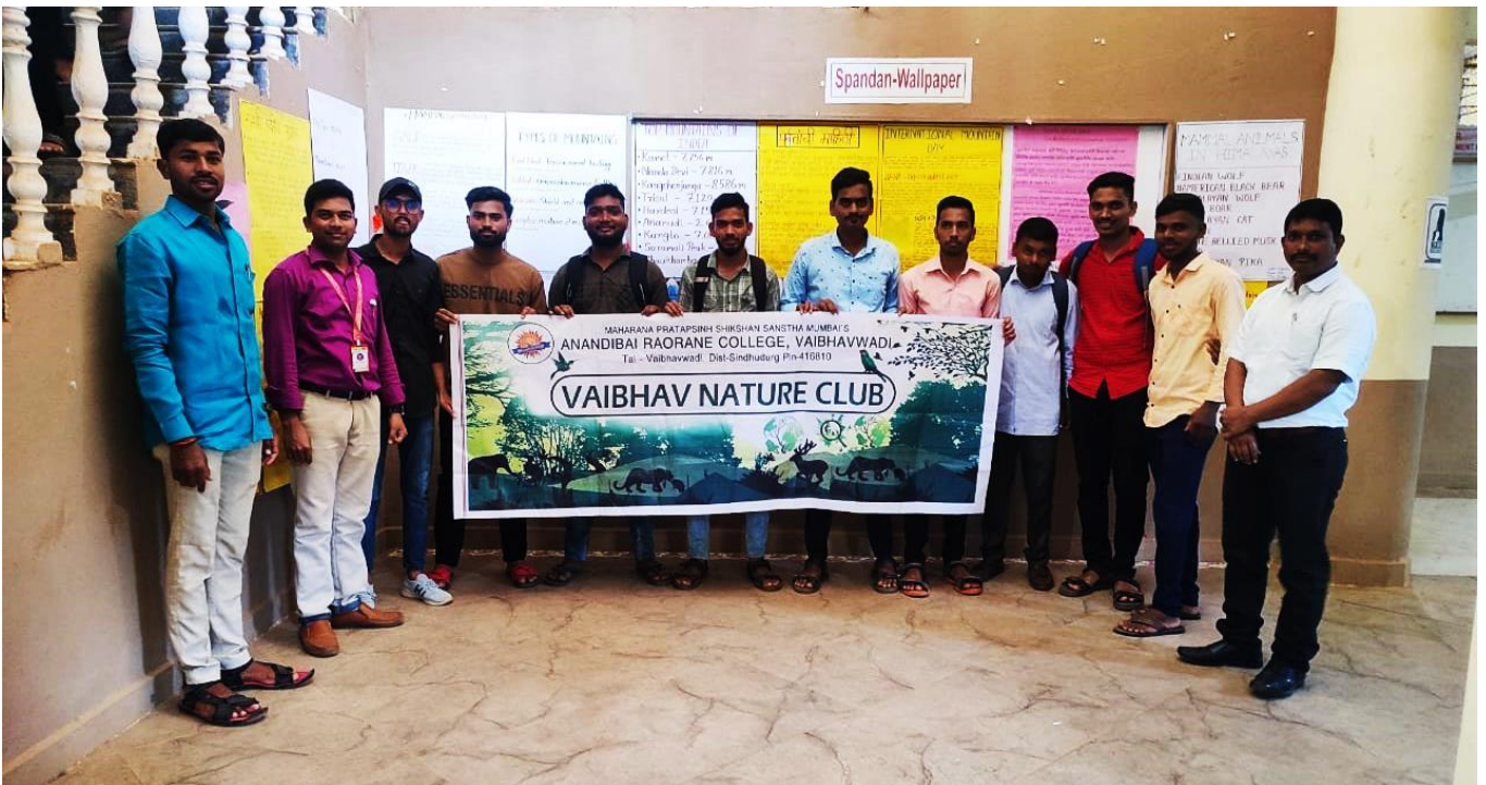
Poster presentation: International Mountain Day