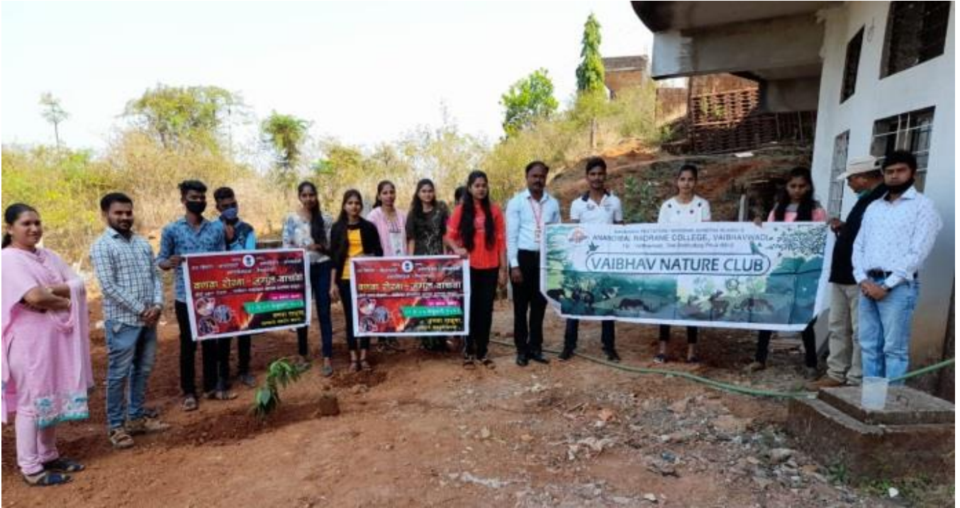
Programme on fire prevention 05 Feb. 2021