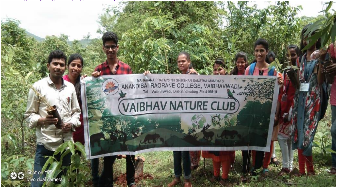
Tree plantation activity, volunteers, 2019-20