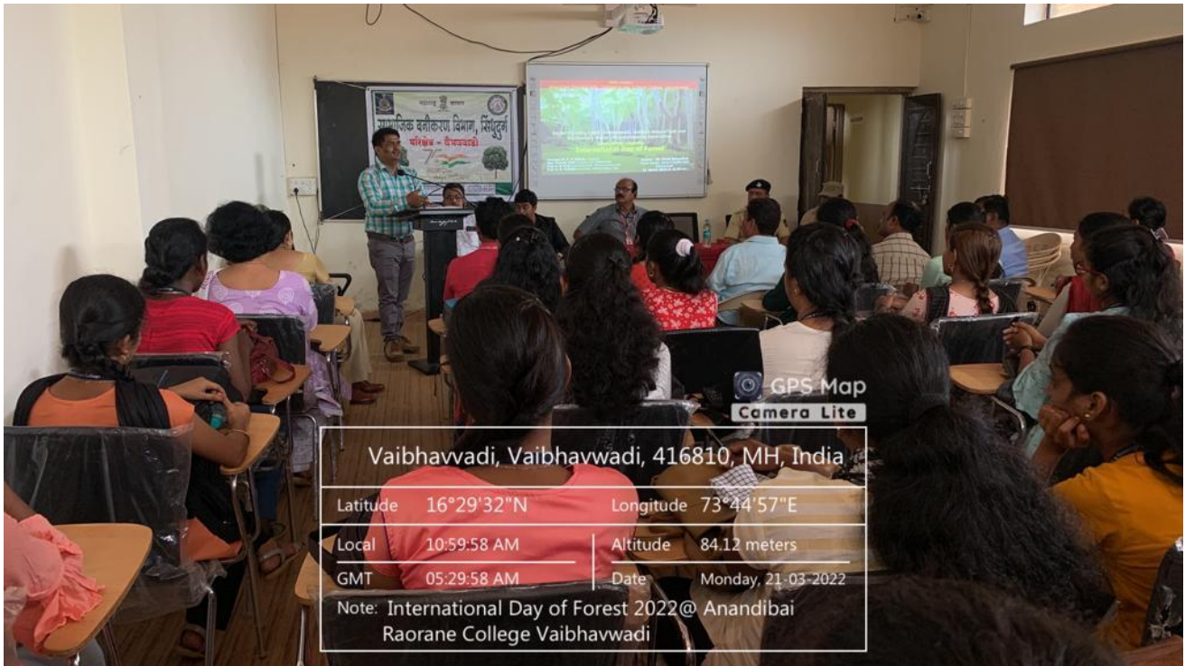
International Day of Forest celebrated on 21 march 2022