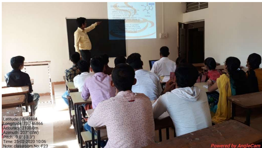
Classroom No. -F23