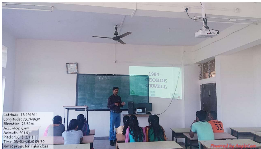
English Department- G08