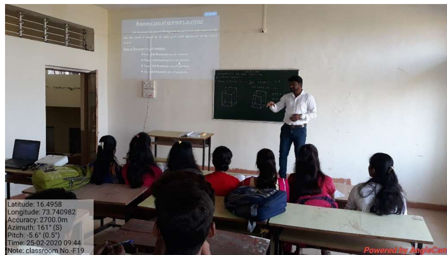
Classroom No.- F19