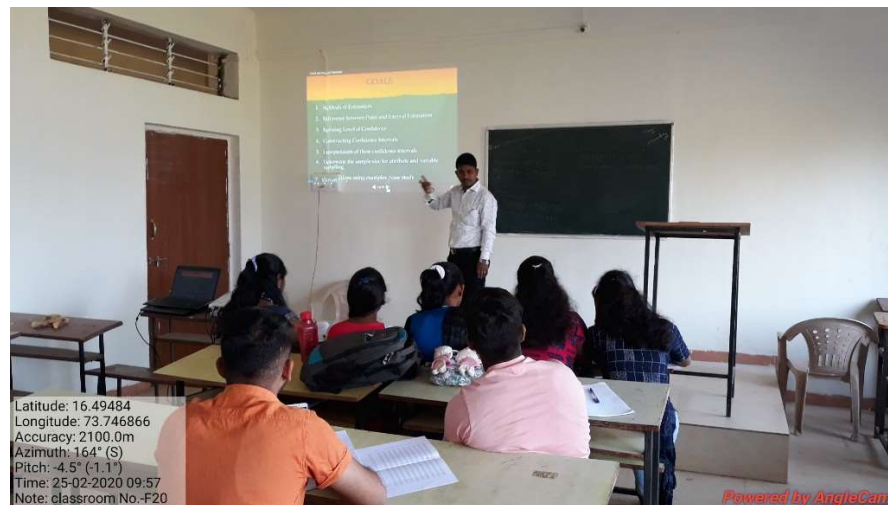
Classroom No.- F20