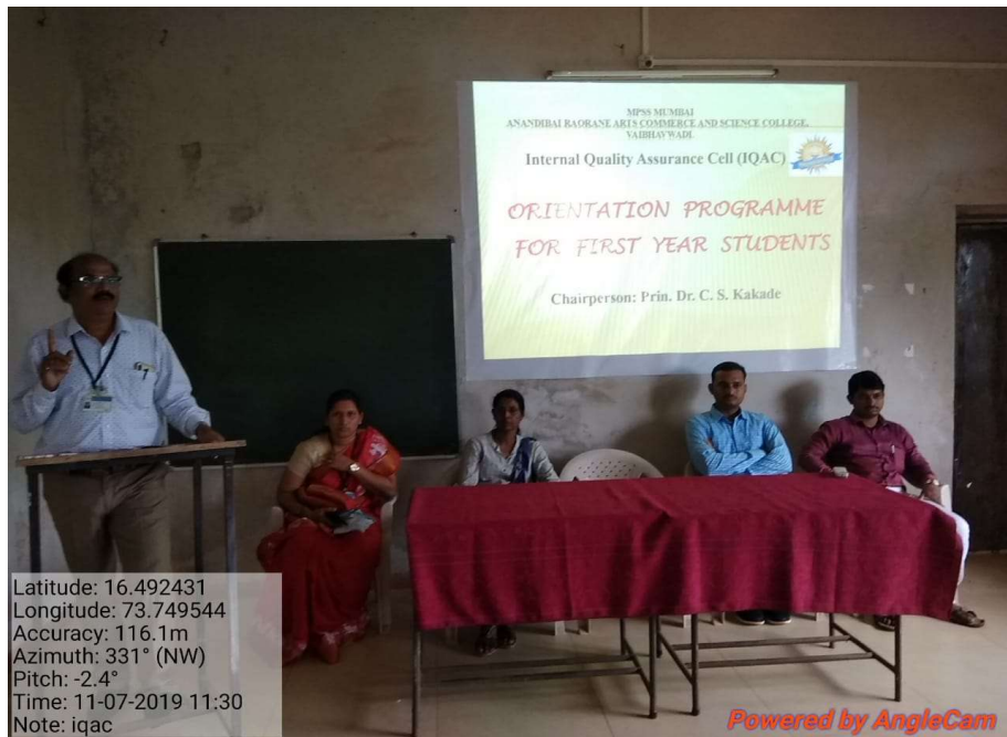
Seminar Hall/Smart Classroom- F26