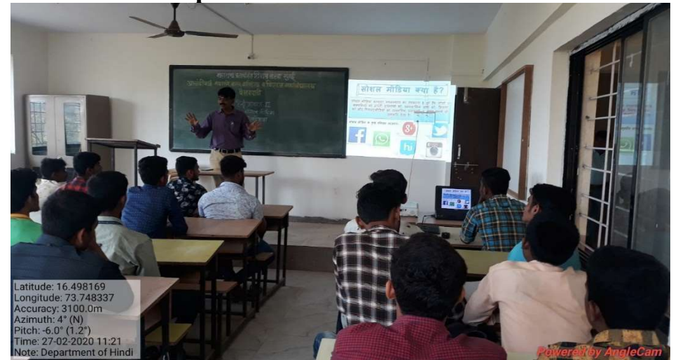
Department of Hindi- B01