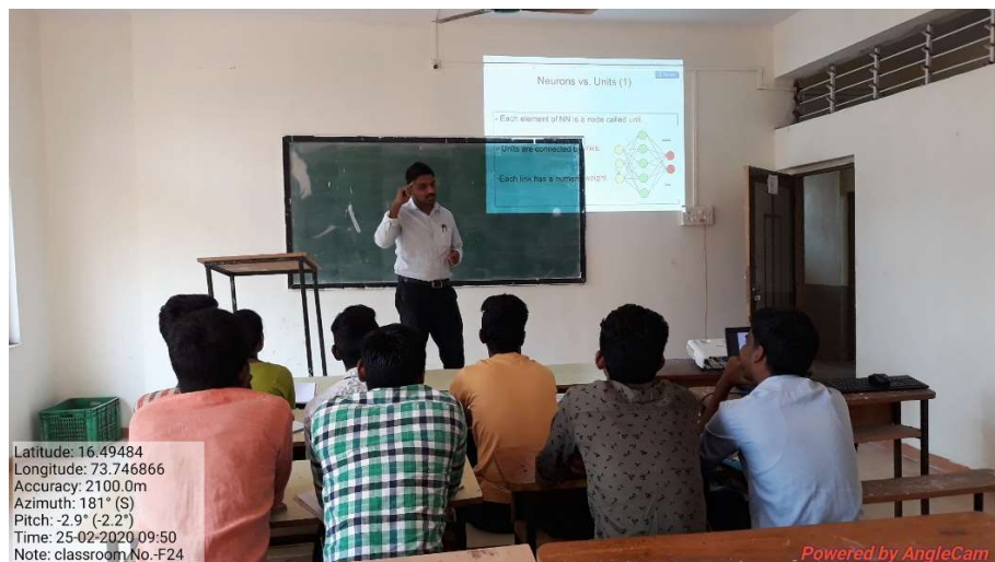
Classroom No.- F24