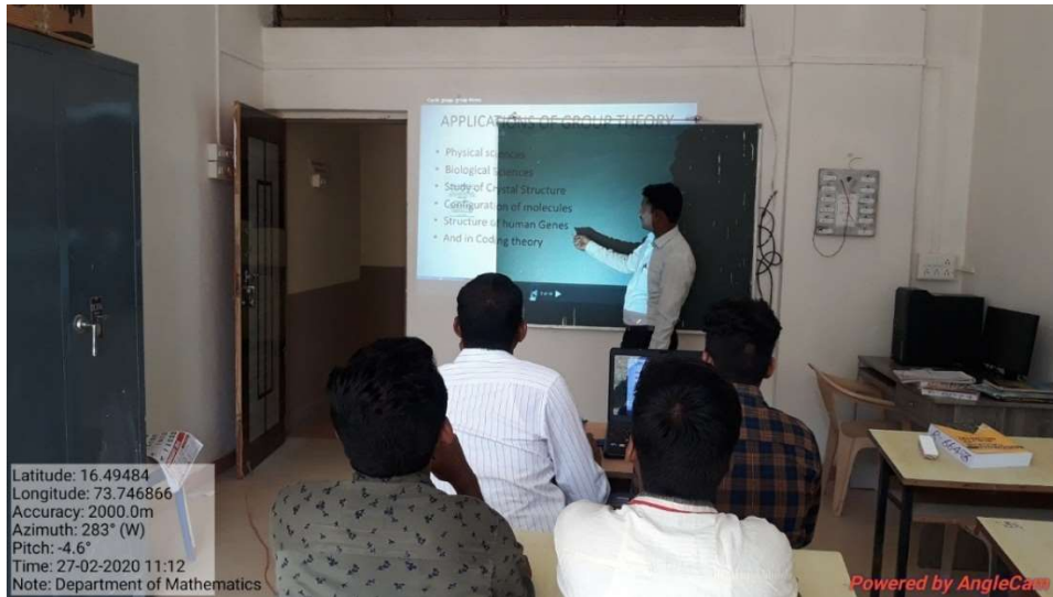
Department of Mathematics-F03